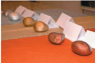
SILVER, GOLD, AND BRONZE DELUSIONAL BOULDER AWARDS

nary sensations and experiences. Dr. Grof gives the babbling accounts of doped hyperventilators the status of reality; he deduced from them even the concept of Cosmic Consciousness. According to Grof, human consciousness can through the change of Ph of the blood detach from the body and transport to one of the past lives or to the time of biological birth. Dr. Grof is also the cofounder of a “canine–feline (dog–cat) discipline”—transpersonal psychology—which is trying to unite science and spirituality.