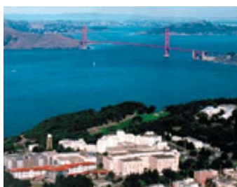
SAN FRANCISCO VA MEDICAL CENTER

The program is an evolving thing. We are charting new ground, at least within the context of the Veterans Administration and the University of California San Francisco Medical School—conceptually, methodologically, and programmatically.